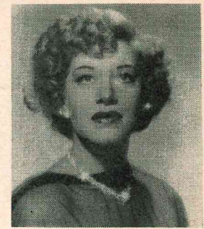
Fourth Vice-President Regina Resnik