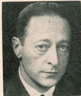
First Vice-President Jascha Heifetz